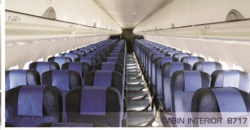
CABIN INTERIOR B717