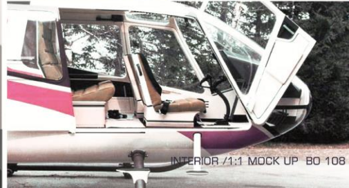
INTERIOR /1:1 MOCK UP BO 108