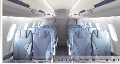
INTERIOR /1:1 MOCK UP CRJ900

BUSINESS CLASS SEATS LUFTHANSA INDUSTRIAL DESIGN & VISUALIZATION